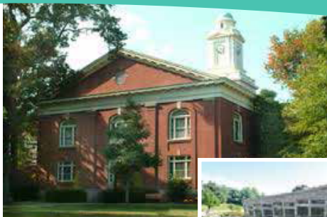
Phelps Stokes Chapel